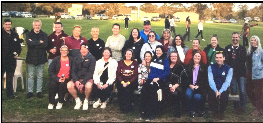
Class of 1990-95 Maiden names used.

Also a number of past players returned to witness the games played on the day. The August game the premiership Brim Eagles 1995 Reserves premiership side had their reunion. If anyone is willing to send photos of this event for the next newsletter, please do not hesitate.